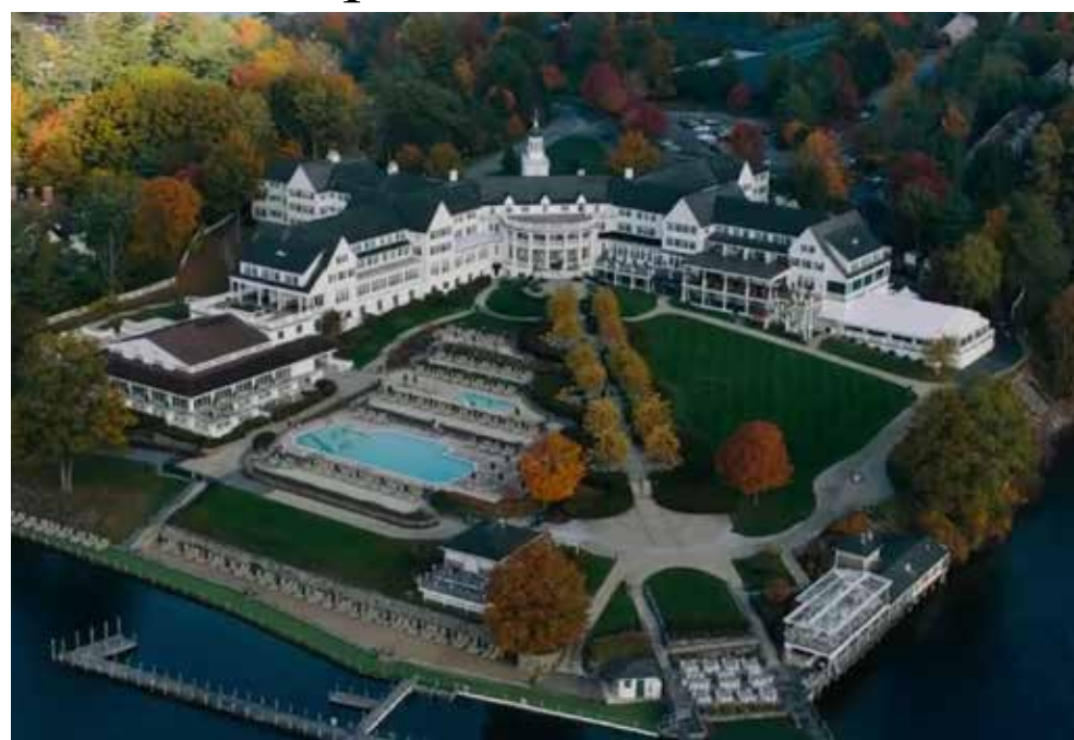
The Sagamore, on Lake George in Bolton Landing, NY