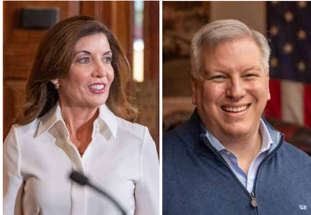
Governor Kathy Hochul, left, and Harry Wilson, right

Westchester democrats and republicans are heading to the polls, during early voting this week, and for the upcoming primary on June 28 for Governor and Assembly. Due to court cases and the redistricting of congressional lines in NY, another primary will be held in August for Congress and State Senate?