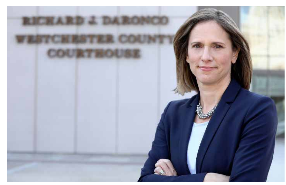
By Dan Murphy

On June 8, Westchester County District Attorney Miriam E. Rocah announced a comprehensive gun safety plan following a sweeping series of state and local legislation strengthening New York's gun safety laws in the aftermath of the Uvalde