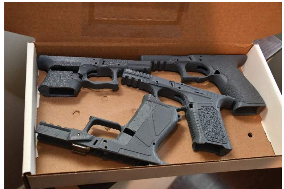
above: Ghost Guns seized in Cortlandt Manor