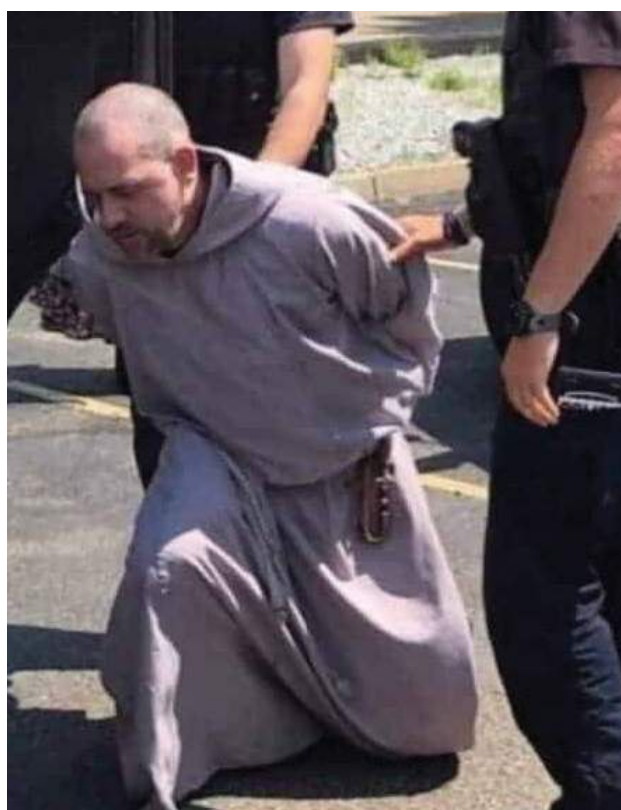
A protestor arrested outside of a White Plains clinic in 2021

On Aug. 7, by a 13-3 vote, the Westchester County Board of Legislators repealed a portion of the Reproductive Health Care Facilities Act, passed by the BOL in 2022, and signed into law by County Executive George Latimer, after the US Supreme Court overturned Roe v Wade. Legislators removed requiring pro-life advocates to stay 8 feet away persons entering and leaving health care facilities in Westchester that offer abortion services.