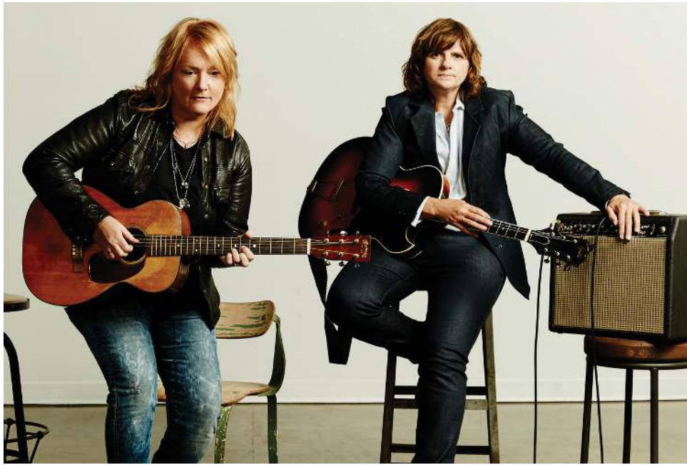
Concert takes place November 3rd at The Capitol Theatre, Port Chester

Each year, the Pace Women's Justice Center (PWJC) commemorates Domestic Violence Awareness Month in October with the culmination of its Raising the Bar Benefit Concert. This year's concert will take place at the Capitol Theatre on Thursday, November 3rd, at 8:00 PM. The full-length concert will be exclusively performed by the Grammy-winning duo, Indigo Girls. The singer-songwriter twosome of Emily Saliers and Amy Ray is considered one of the most successful folk duos in history, with 16 recorded studio albums and over 15 million records sold. Popular for their crowd singalong 1990's chart hits "Galileo," "Shame on You," and "Closer to Fine," which was recently featured in the box office summer hit movie Barbie. Together, these two women are known for their activism and championing of causes.