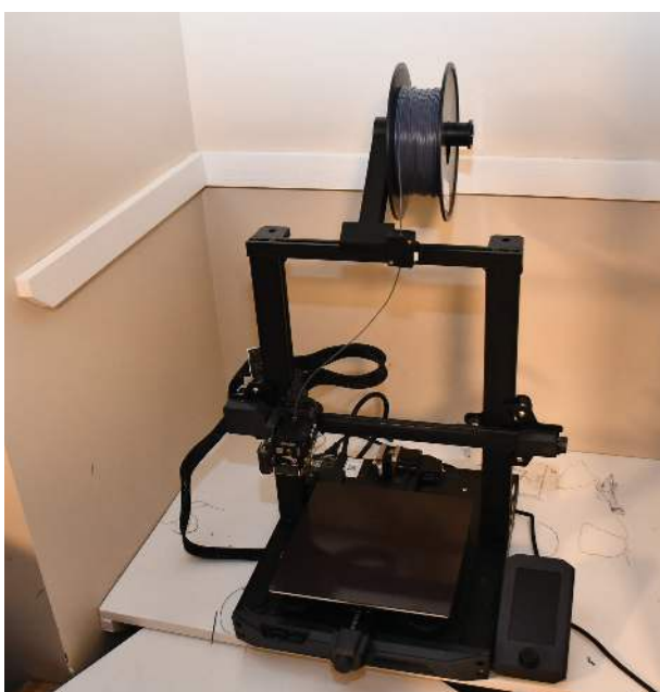
left: 3D Printer used to help make Ghost Guns

Westchester County Police arrested a Cortlandt man today and charged him with manufacturing and possessing untraceable "ghost guns" in his home.