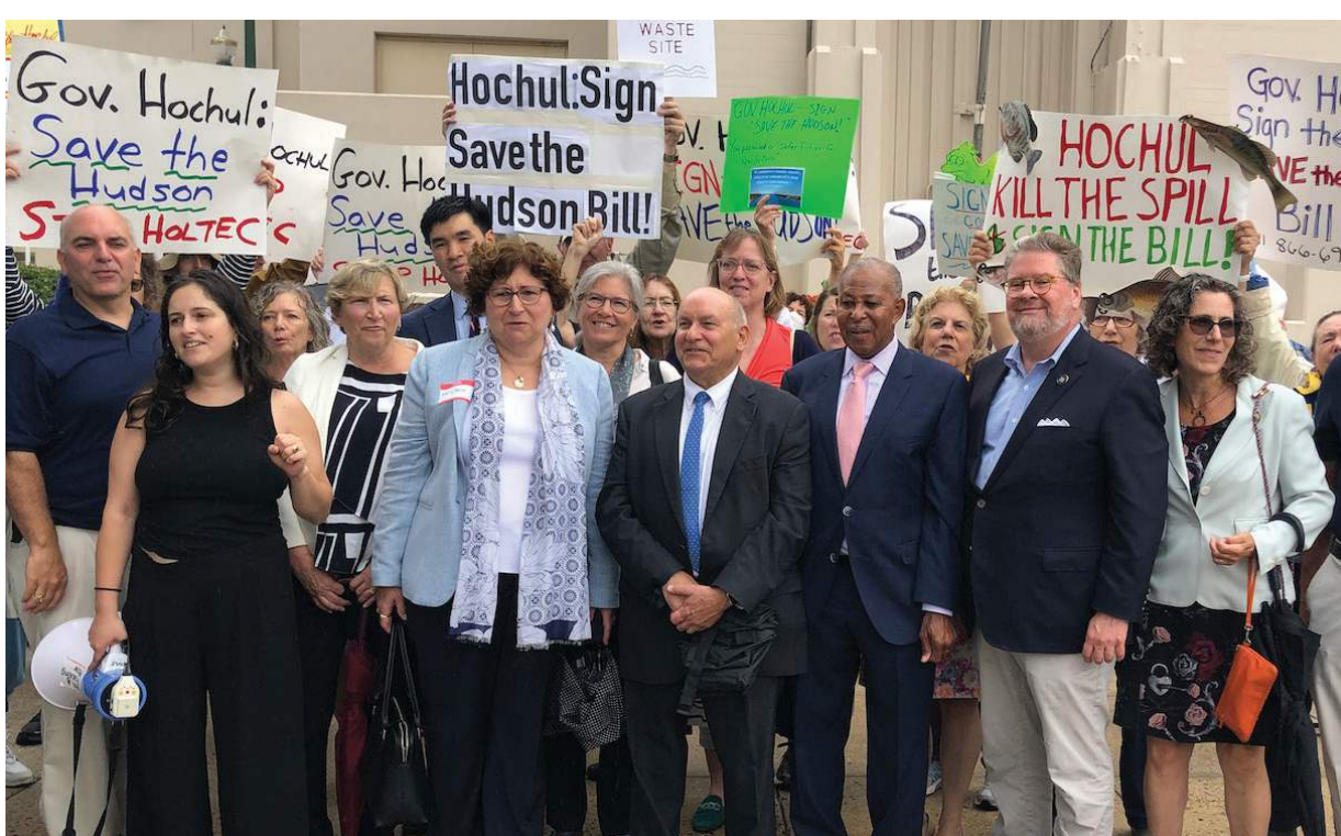
Save the Hudson from Holtec Rally in White Plains with elected officials and advocates

The news last month that the Massachusetts Department of Environmental Protection had denied a permit for Holtec to dump one million gallons of nuclear waste into Cape Cod Bay is good news for the many in Westchester who are trying to get Governor Kathy Hochul to sign a bill passed in June, which also would deny Holtec the right to dump one million gallons of toxic waste into the Hudson River.