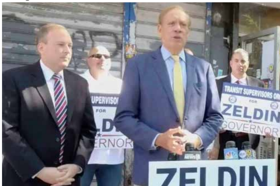
former NY Governor George Pataki, right, endorses Lee Zeldin for his old job

On September 20, the last Republican Governor of the State of New York, Westchester native George Pataki, endorsed Congressman Lee Zeldin, the republican candidate for governor in 2022.