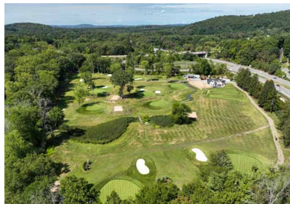
drone photo of Par -3 9-hole course in Yorktown under renovation