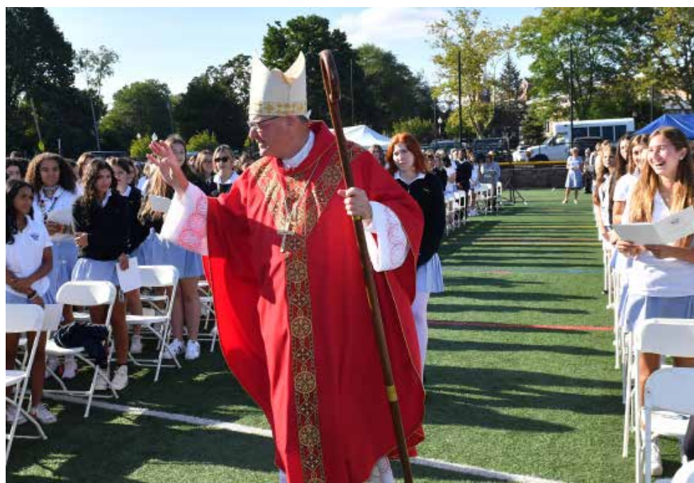
Above: Cardinal Timothy Dolan joins the celebration of the Ursuline School's 125th Year; Below Cardinal Dolan visits a new Finance classroom at Stepinac High School