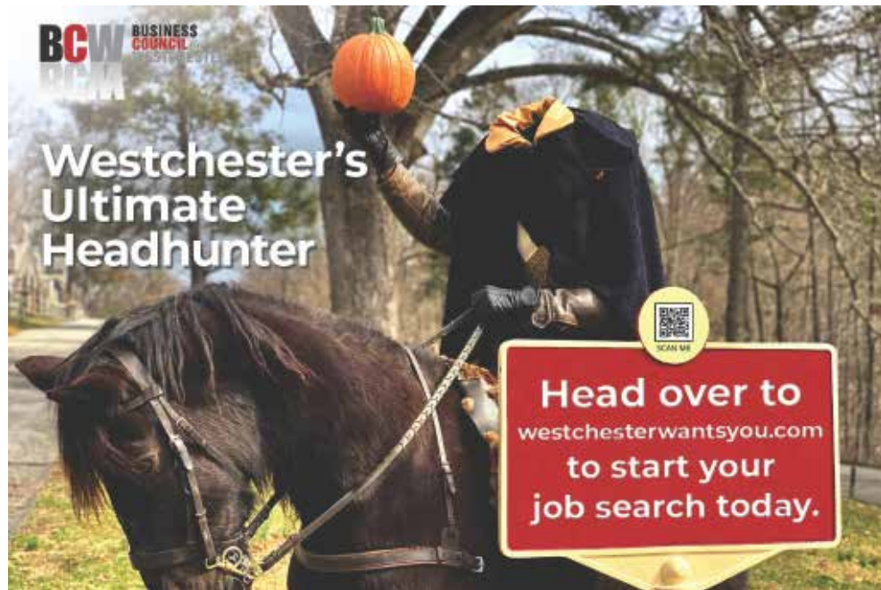
BCW and HHV Blaze a New Trail in Search of Talent

More than 125,000 tri-state visitors to the Great Jack O'Lantern Blaze will participate in one of the largest workplace talent searches ever held at a live event in Westchester County