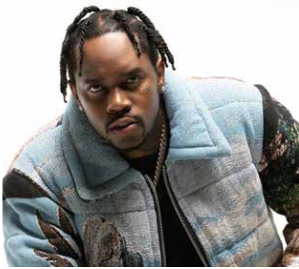
Brooklyn native Fivio Foreign, one of the most popular Drill Music performers, left