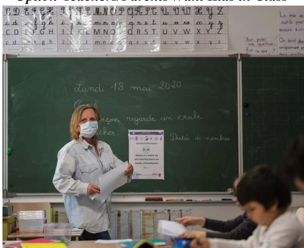
Teachers across Westschester and New York State are ready to welcome back students to the classroom after Labor Day, without a remote option