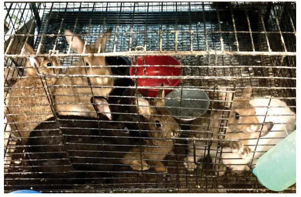
Rabbits, pictured above, and Ducks and other animals were crammed into cages at Pet Worl in Yonkers

Thanks to a joint investigation by SPCA Westchester Humane Law Enforcement Unit officers, Yonkers Police, Yonkers Building Dept. and the Westchester Health Dept., Pet World, located at 433 South Broadway in Yonkers has been shut down and their license revoked. As you can see from these photos, the conditions these poor animals were living in is heartbreaking. It was a team effort and we are very relieved to know that no more animals will needlessly suffer here.