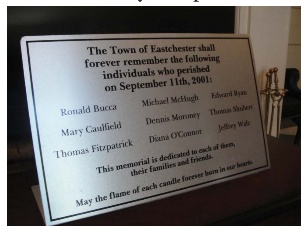
The Town of Eastchester will honor the Nine community members lost on September 11, 2001, above