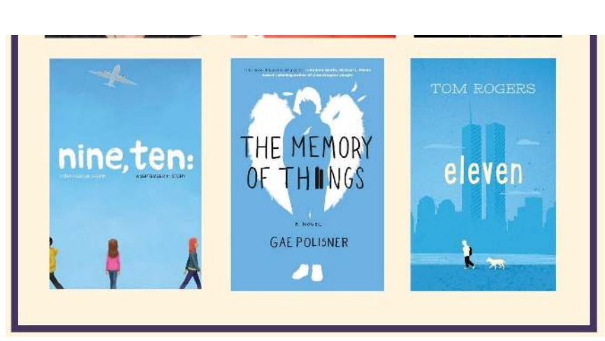
The Harrison Library will feature three books about September 11, and their authors this month