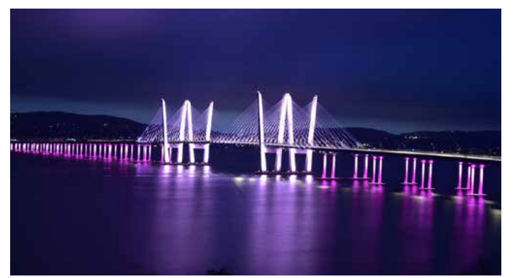
The Cuomo-TZ Bridge will be lit in Purple for Alzheimer's Awareness

Prelude for Westchester Walk to End Alzheimer's Oct. 3,