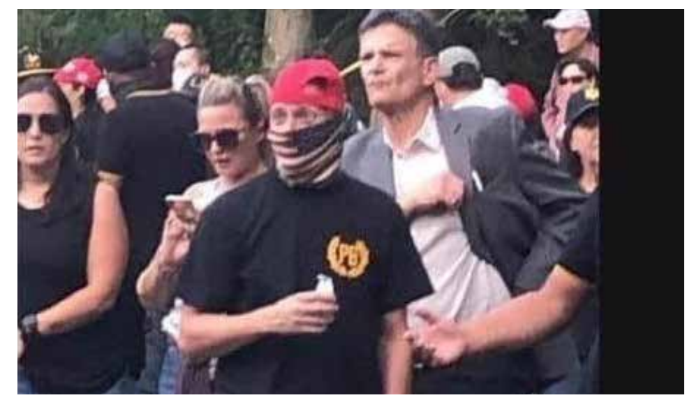
Below: Social Media Posting about Proud Boys in Briarcliff on August 5. Above: Zoomed in photo of mystery man in Grey Suit next to Proud Boys