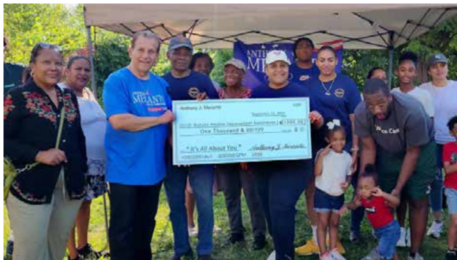
$1,000 Donation to Runyon Heights Improvement Association