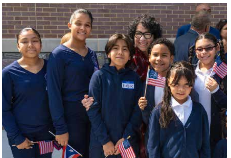
US Supreme Court Justice Sonia Sotomayor, with students at the new Sotomayor school -See Story on Page 15-and photo on pg 9