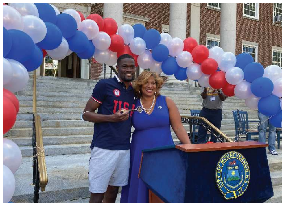
Mount Vernon Mayor Shawyn Patterson-Howard gives the key to the city to hometown Olympic hero Rai Benjamin