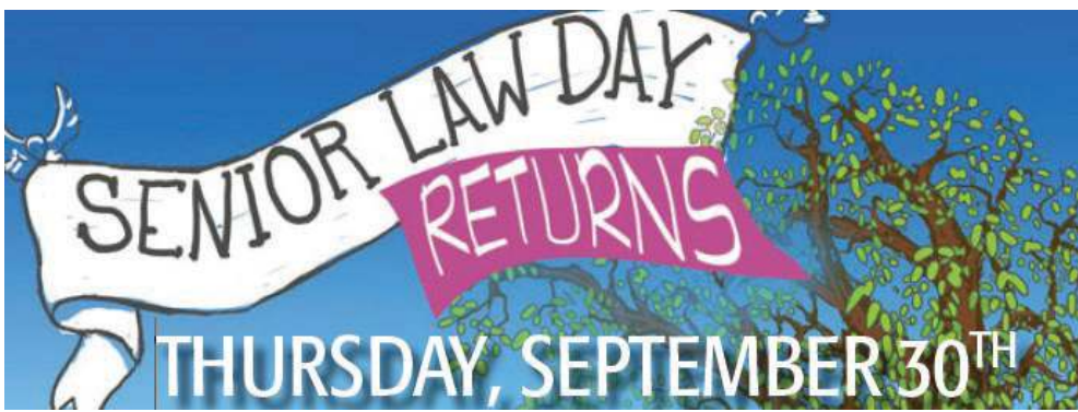
see story on pg 4-