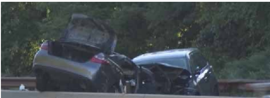
accident wreckage on the Hutchinson Parkway