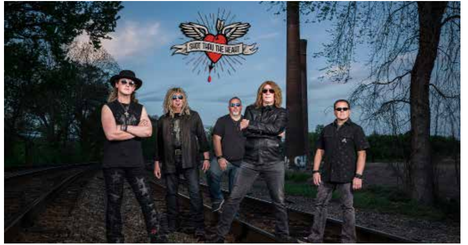
"Have a Nice Day" on the Great Lawn enjoying a tribute to Bon Jovi.

The Robison Summer Concert Series concludes with Shot Thru The Heart - A Tribute to Bon Jovi on Sunday, Sept. 15, from 3 p.m. to 5 p.m. at Kensico Dam Plaza in Valhalla.