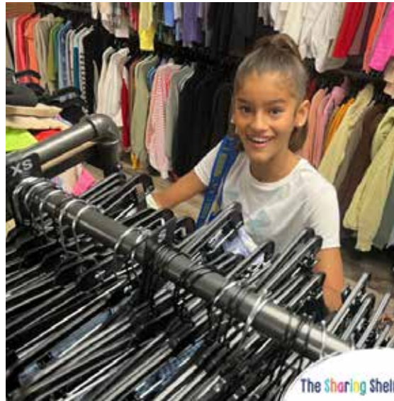
The Sharing Shelf collects clothes distributed for free to low-income children and teens

The Sharing Shelf, the nonprofit clothing bank serving Westchester County, unveiled today the results of a survey of more than 100 caseworkers at the schools and social service agencies served by the nonprofit organization. The survey illuminates both the types of clothing needed and the impacts on students of not having age-appropriate, season-appropriate, well-fitting clothing that reflects the personality of the students. The Sharing Shelf addresses the clothing needs of children and teens – from newborn to age 19.