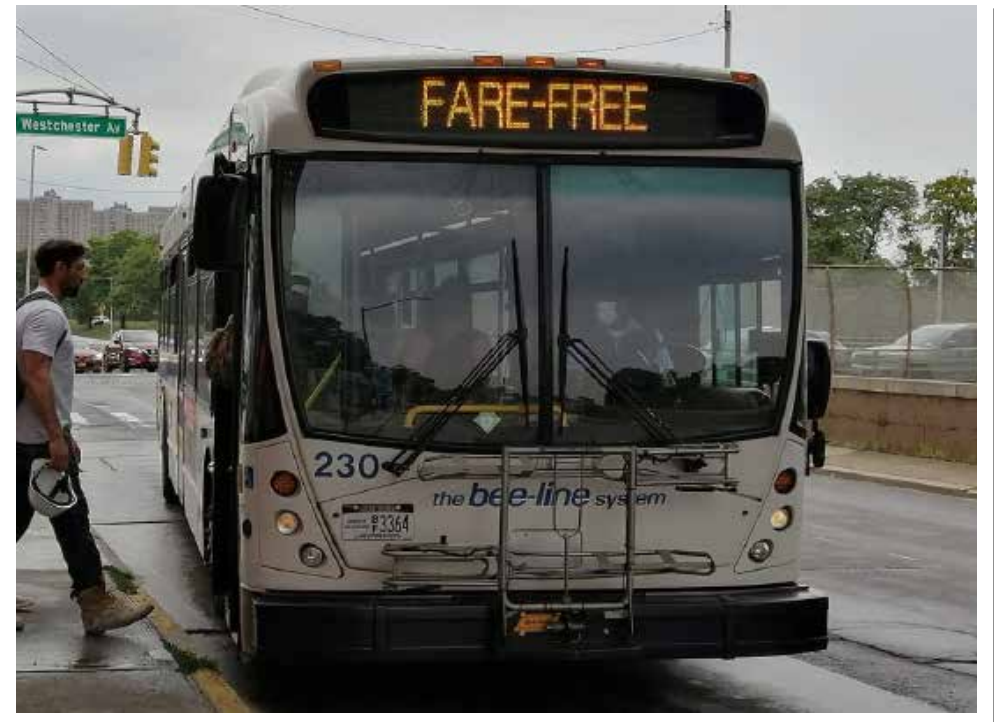
"In your zeal to find fault with our efforts, you have shown your unwillingness to be "included" but rather to sit outside the process and be critical. So be it," County Executive George Latimer

The Debate over Busing in Westchester: Latimer Fires Back at Critical Bee Line Report