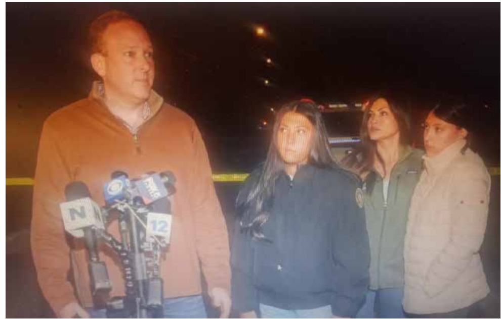
Congressman Lee Zeldin, the republican candidate for Governor, with family, outside his Long Island home after drive by shooting

Drive By Shooting at Zeldin Long Island Home Point to Trouble Elsewhere