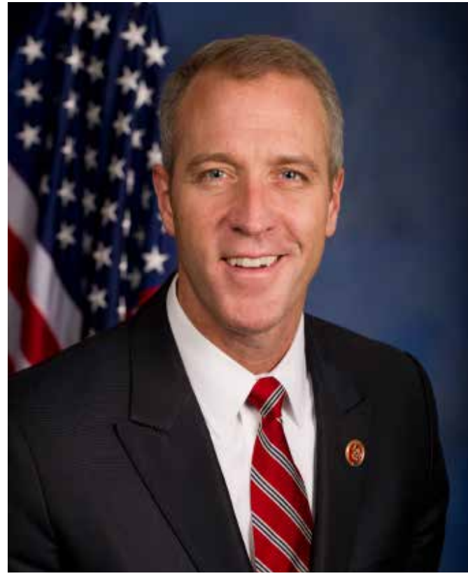
Rep. Sean Patrick Maloney

When it comes to reproductive rights, my position is simple: women should have the freedom to control their own bodies. I believe health decisions are best made by a woman and her doctor — not politicians.