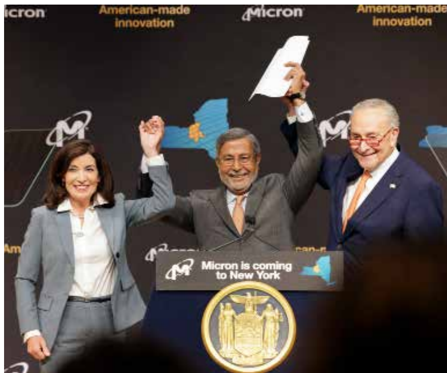
l-r-Governor Kathy Hochul with Micron CEO Sanjay Mehrotra and U.S. Senate Majority Leader from NY Chuck Schumer

On October 4, Micron CEO Sanjay Mehrotra announced one of the largest economic development projects in U.S. history — a transformational public-private partnership with Micron Technology to build a cutting-edge semiconductor manufacturing campus in Onondaga County, New York.