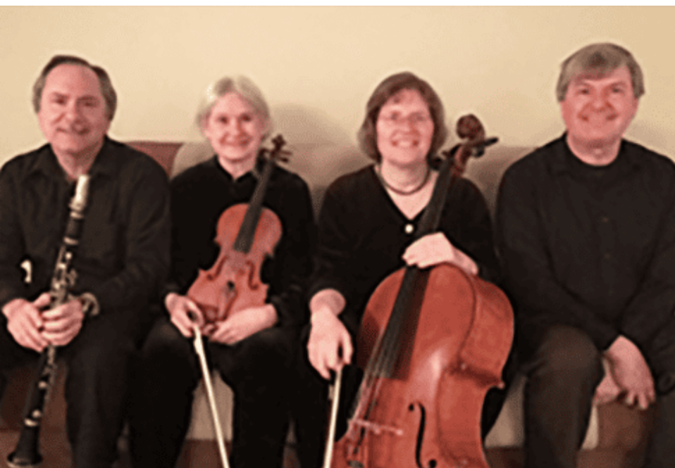
Wilderness String Quartet