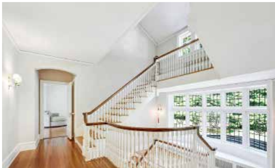
274 Broadview Avenue, New Rochelle