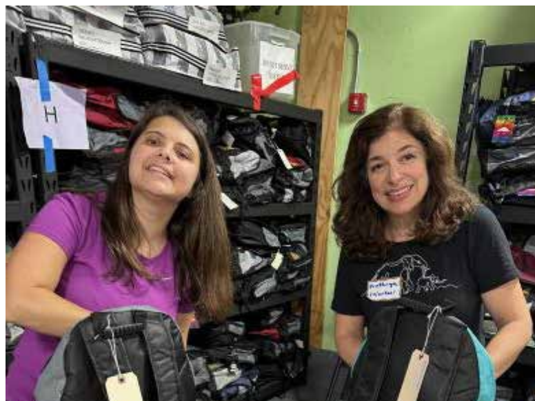
Volunteers filling backpacks at The Sharing Shelf in Port Chester.

The Sharing Shelf, the nonprofit clothing bank serving Westchester County, announced today the record-setting results of its 14th annual “Backpacks to School” initiative. Through that initiative, which ran for six weeks ending on September 20, hundreds of volunteers joined together to assemble, fill, and distribute – free of charge – backpacks filled with grade-appropriate school supplies for Westchester students in need.