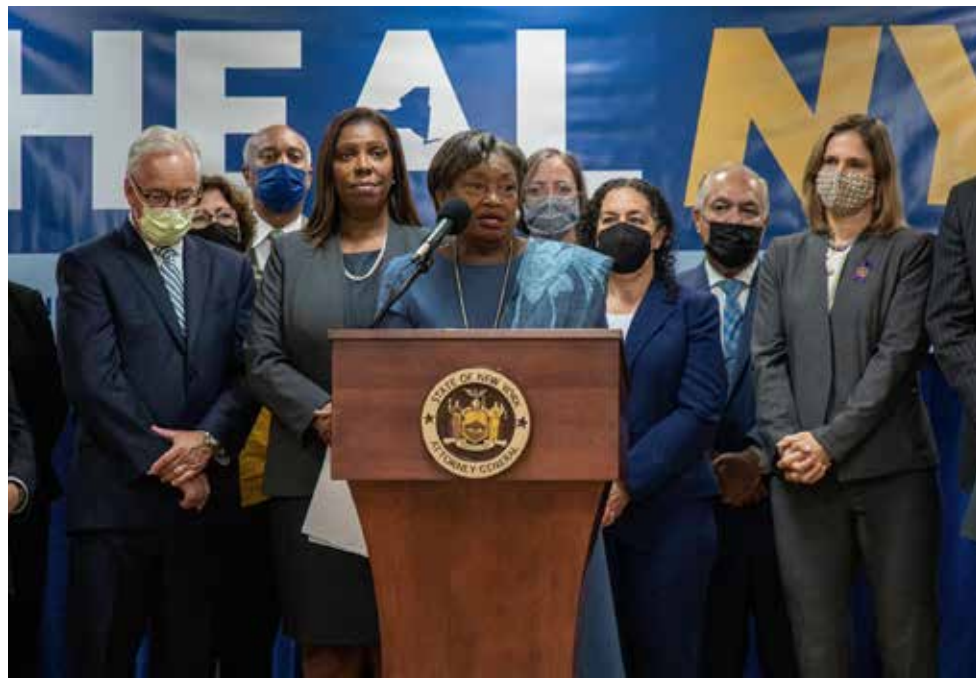
Senate Majority Leader Andrea Stewart-Cousins, with New York Attorney General Letitia James and elected officials

NY Attorney General Letitia James today continued her statewide ‘HealNY’ tour of New York state with a stop in Westchester County today, where she announced that she will deliver up to $94 million for the Hudson Valley to combat the opioid epidemic. The funds come from different settlements Attorney General James has negotiated following her March 2019 lawsuit against the various manufacturers and distributors responsible for the opioid crisis. Attorney General James’ tour will make stops in dozens of New York counties throughout the month of October, with up to $1.5 billion in funds going to counties across New York state.