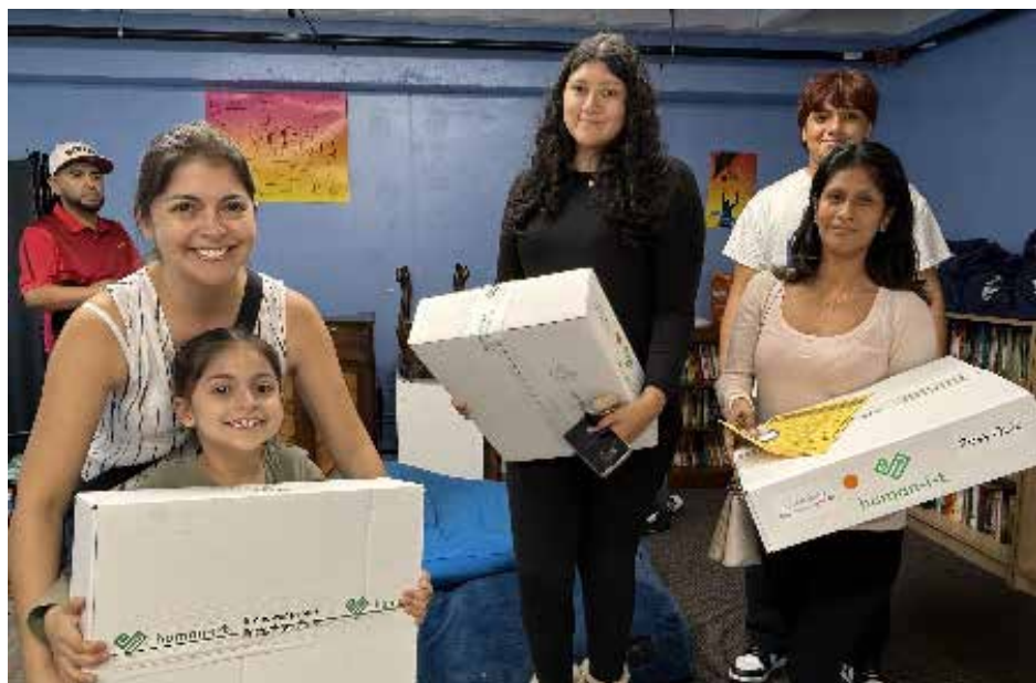
Teens and adults receiving their new laptops at Port Chester Carver Center.

AT&T* and Human-IT provided The STEM Alliance of Westchester County with 75 refurbished laptops yesterday to distribute to families in need.