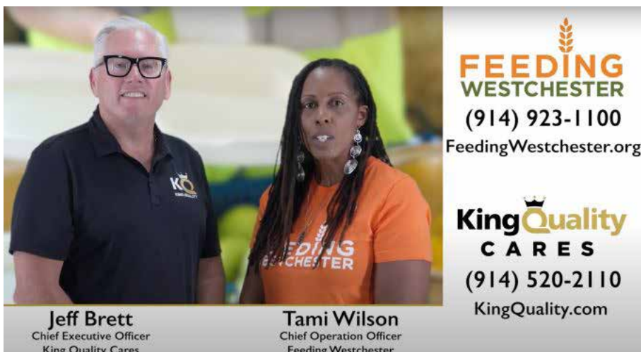
Long Island-based contractor marks expansion into Westchester by supporting nonprofit's mission of nourishing neighbors in need

King Quality Roofing and Siding, a Long Island-based contractor, has awarded a marketing grant worth approximately $30,000 to Feeding Westchester, a local nonprofit that sources and distributes food to communities across Westchester.