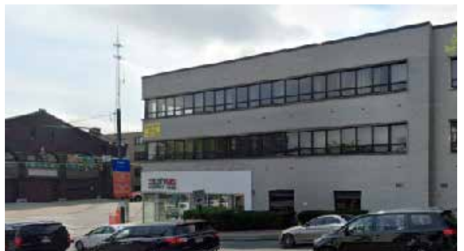
222 Mamaroneck Avenue, White Plains