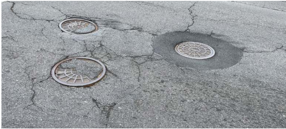
Potholes, craters and uneven surfaces dot Tuckahoe Road, Yonkers. More photos online at YonkersTimes.com