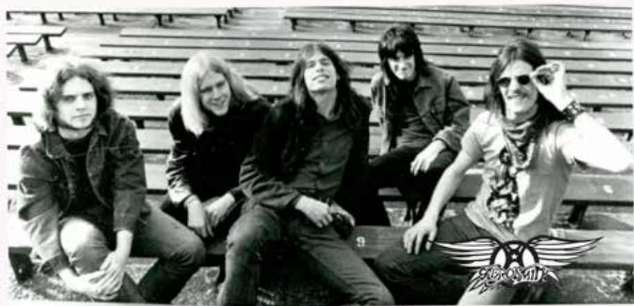
Joey Kramer, Tom Hamilton, Steven Tyler, Joe Perry, Raymond Tabano