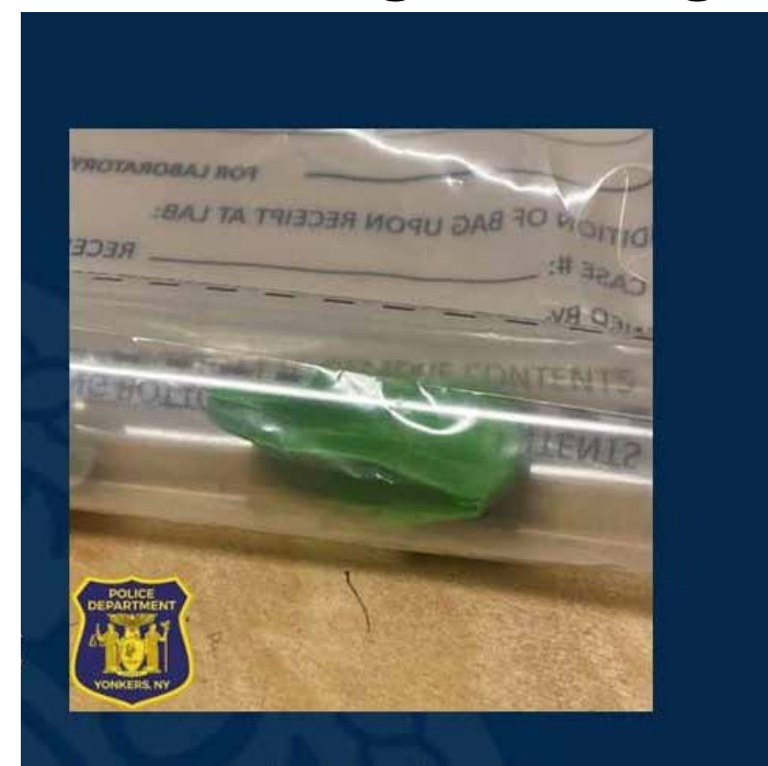
three recent overdoses in Yonkers were believed to have come as a result green packages of heroin laced with Fentanyl, left.

Drug overdose fatalities surged during the COVID-19 pandemic in New York state, with opioid-related overdose deaths increasing by 68% to nearly 5,000 individuals from 2019 to 2021, according to an analysis released today by New York State Comptroller Thomas P. DiNapoli. The surge is largely due to a sharp increase in deaths from opioids related to illicit fentanyl and similar synthetic opioids. Overdose deaths statewide from opioids and all drugs (5,841) in 2021 surpassed the previous 2017 peak by more than 1,700 fatalities.