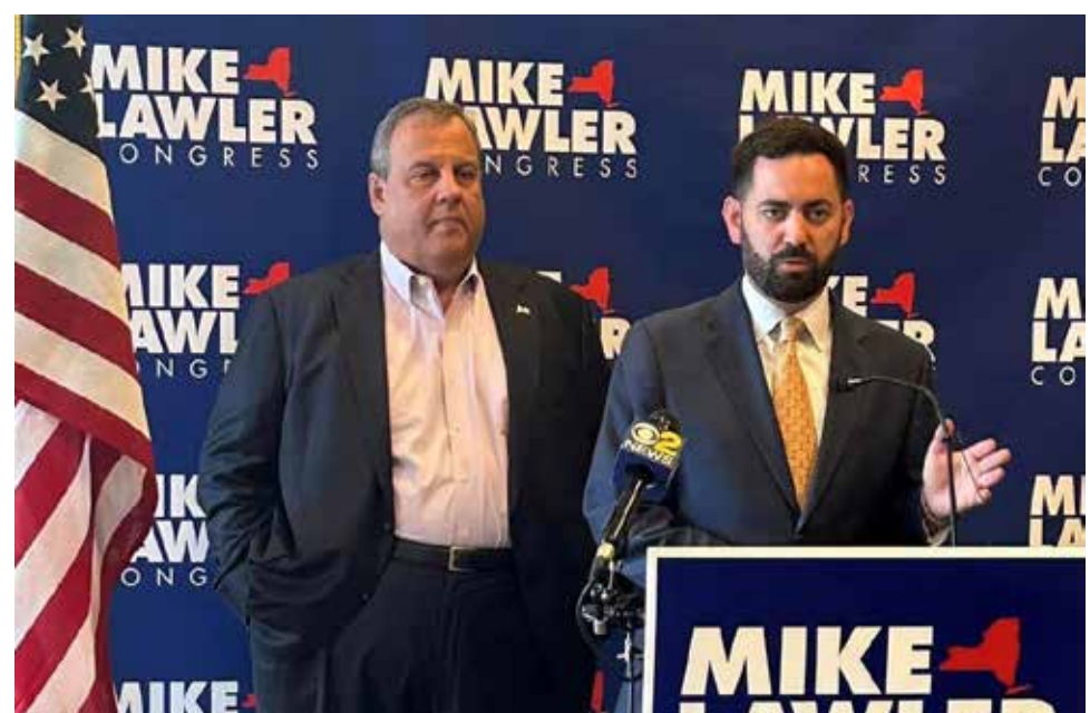
former NJ Governor Chris Christie with Congressional candidate Mike Lawler