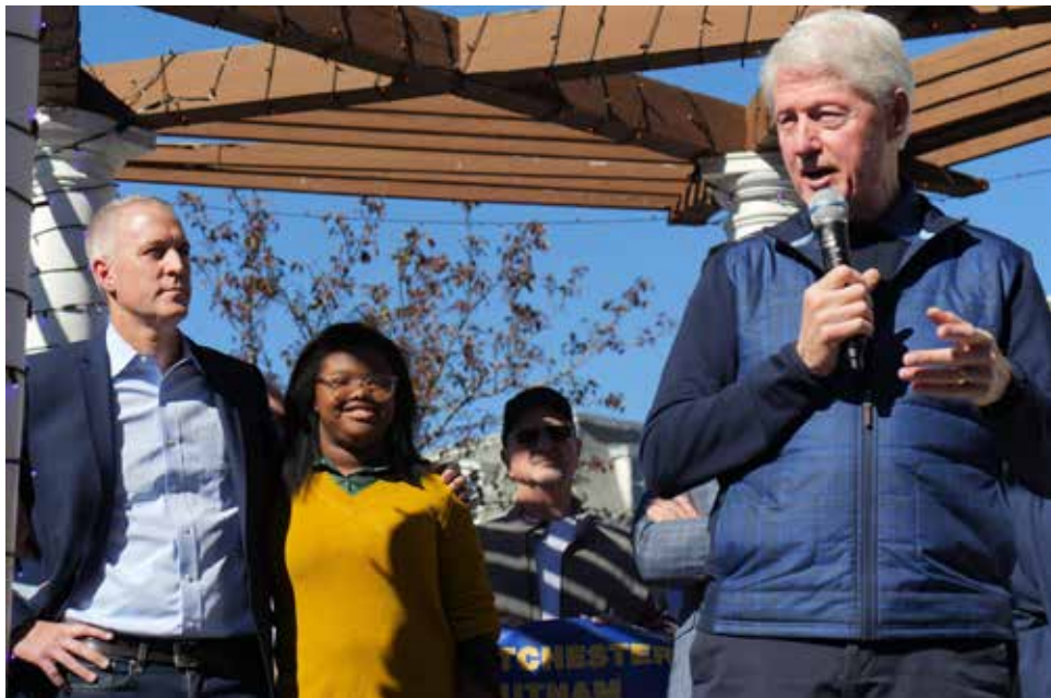
former President Bill Clinton with Rep. Sean Patrick Maloney