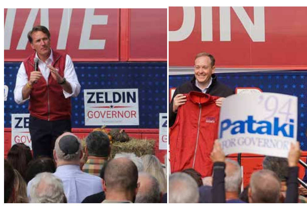
Virginia Governor Glenn Youngkin with Lee Zeldin GOP candidate for Governor