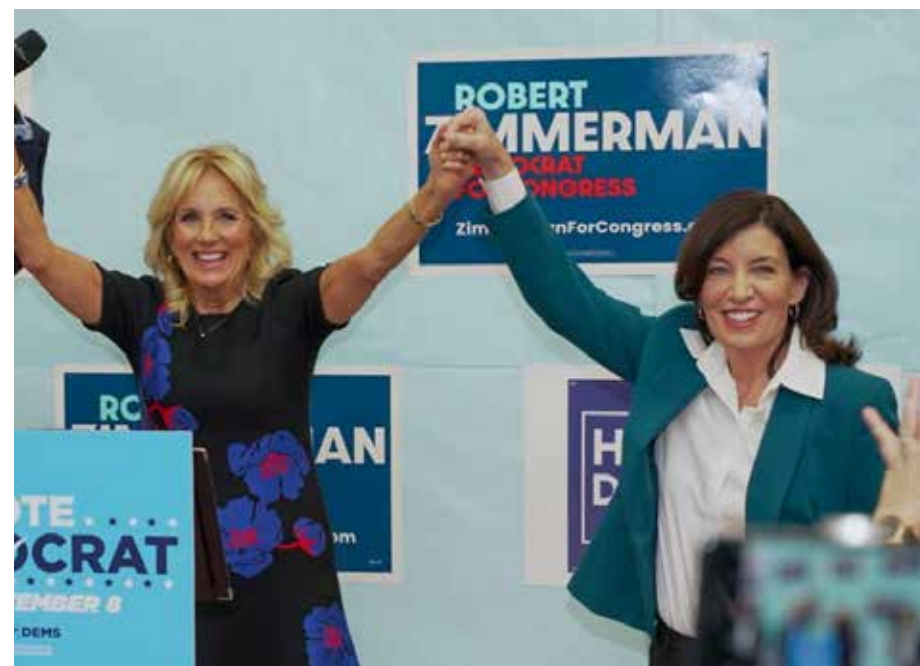
First Lady Dr. Jill Biden with Governor Kathy Hochul