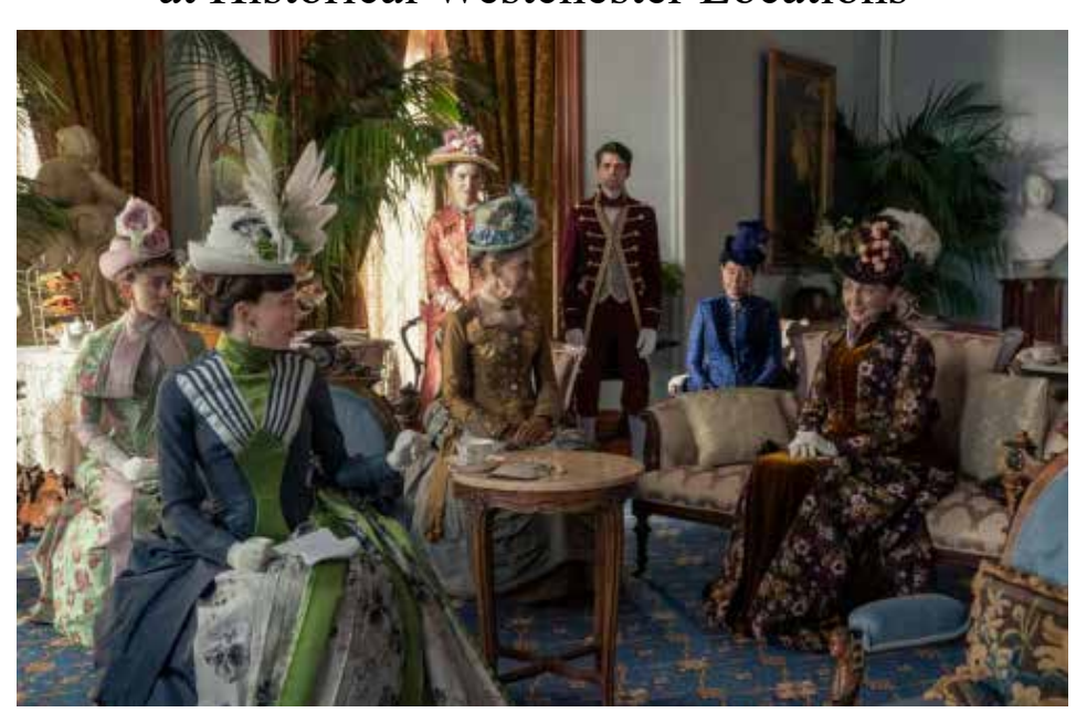
Season two of The Guilded Age included filming at Lyndhurst above

The Guilded Age Season 2 Films at Historical Westchester Locations