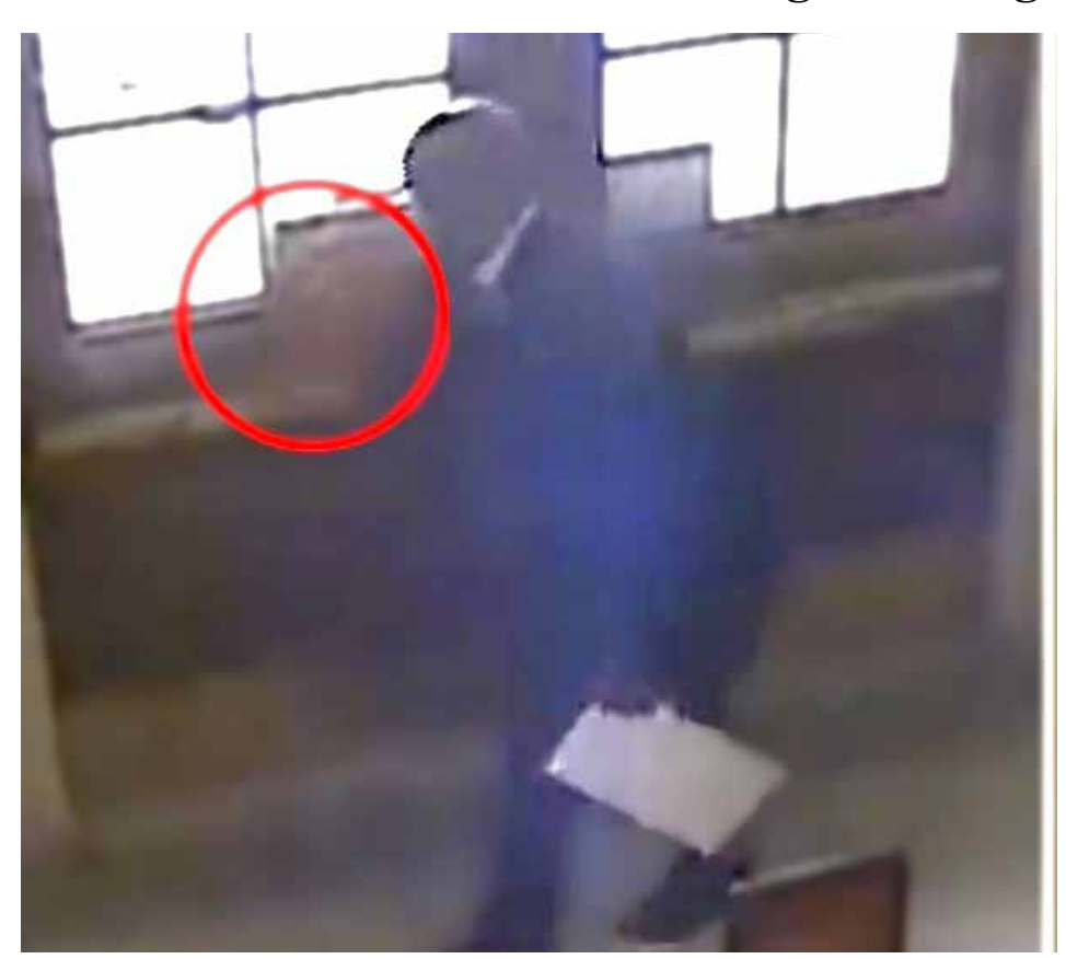
Congressman Jamaal Bowman taking down Emergency Signs before pulling the alarm in DC