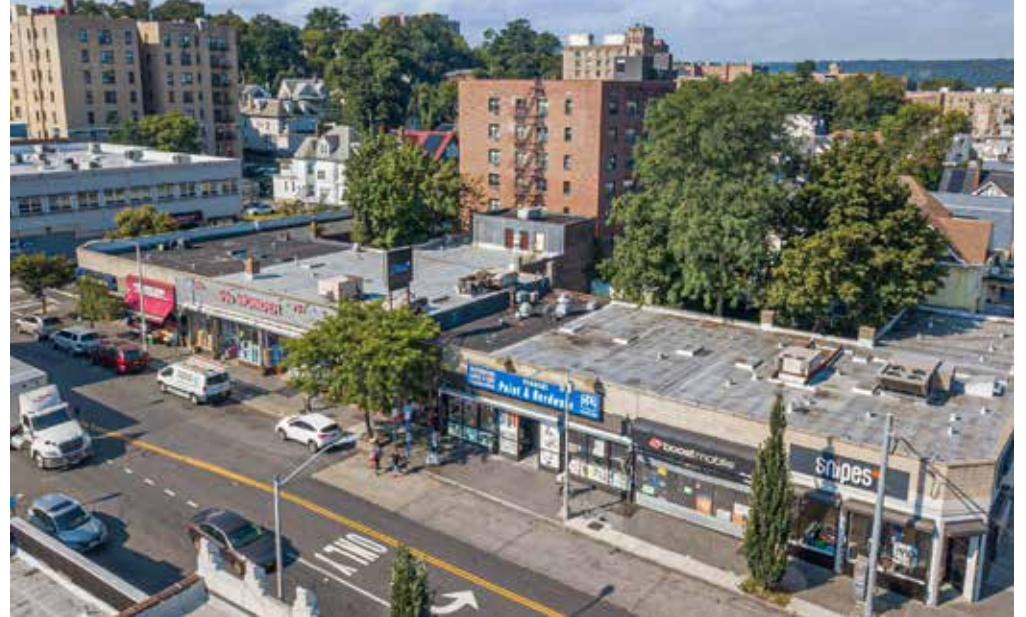
465-479 South Broadway, Yonkers

Houlihan Lawrence Commercial, a division of Houlihan Lawrence, the leading real estate firm serving New York City's northern suburbs, has announced the sale of 465-479 South Broadway, Yonkers, NY for $4.7 million.