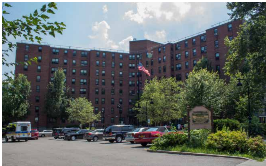
Peekskill's Bohlmann Towers