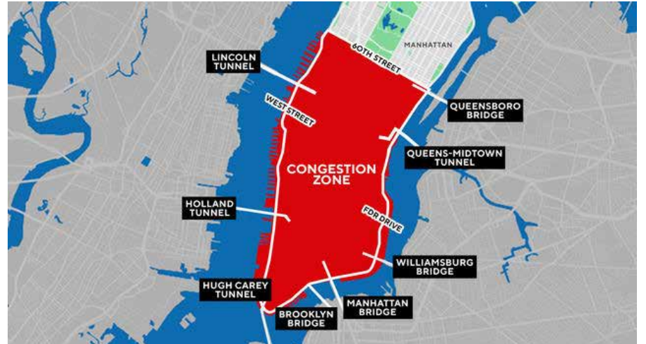
Plan Rushed Through Before Trump Takes Office