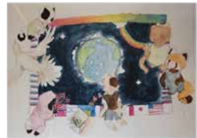
Elizabeth Stewart Hommocks Middle School