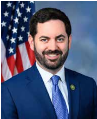
Rep. Mike Lawler