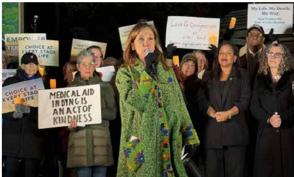
Assemblywoman Amy Paulin, speaking at rally in Scarsdale

Assemblywoman Amy Paulin (D-Westchester) joined faith leaders, state and local officials, and hundreds of advocates at Chase Park in Scarsdale last night in support of the Medical Aid in Dying Act (A136/S138). The legislation, which passed both houses of the New York State Legislature in June 2025, would give terminally ill, mentally capable adults with a prognosis of six months or less the option to request medication to peacefully end their suffering if it becomes unbearable.