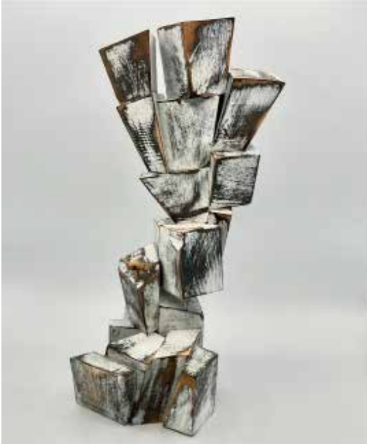
"White," a sculpture by Mike Depasquale, is on display at ArtsWestchester's Futures exhibition.

A new exhibition at ArtsWestchester asks: What can the Hudson Valley look like in 100 years? Futures is an immersive exhibition of large-scale and installation-based artworks. ArtsWestchester invited artists to envision built and social transformation by giving them a seat at the table while planning the show.