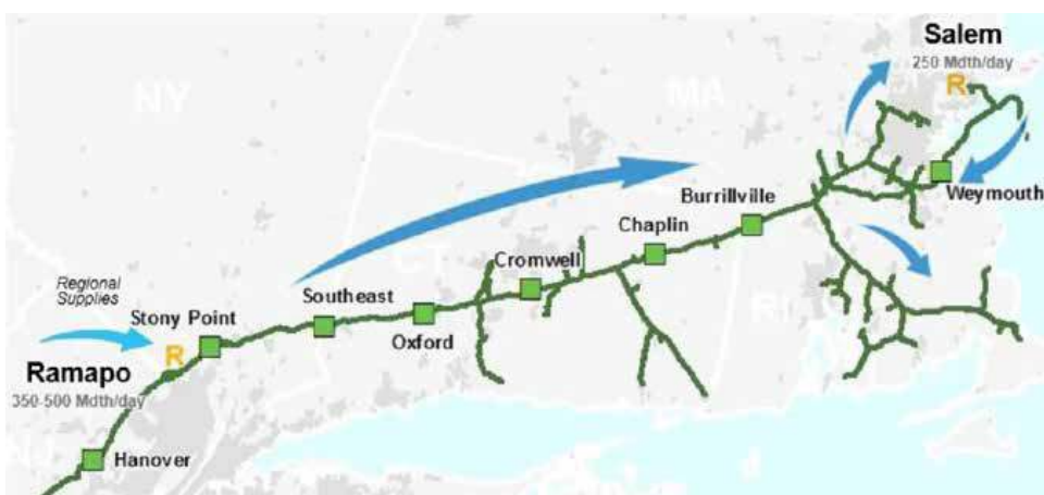
map of proposed pipeline expansion

On Nov. 14, activists rallied outside the shuttered Indian Point nuclear plant in Peekskill, calling on Governor Hochul to stop the latest proposed expansion of the area's Algonquin Pipeline. In 2016, three activists were arrested at the very same site for blocking construction of a 42-inch pipeline constructed as part of the Algonquin Incremental Pipeline Expansion. In addition, two older 30-inch and one 26-inch pipelines run underneath the plant. Decommissioning at Indian Point houses over 2,000 tons of irradiated fuel rods in addition to other radioactive waste.