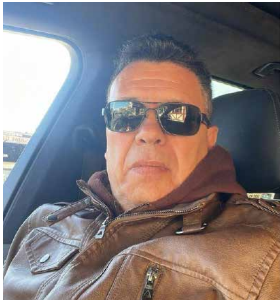
By Frank Spotorno, left

Immigrant Protection Act, continued from pg 1-