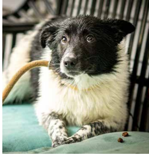
Felix and Nellie had to be euthanized