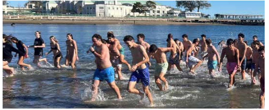
Rye high school students take the Polar Plunge