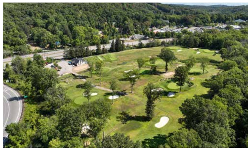
drone photo of Valley Fields Golf Course nearing completion

“This is Now a First Amendment Case that will gain national attention,” --Larry Nussbaum, RC Development