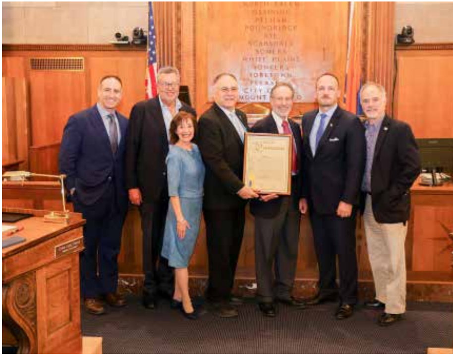
above: legislators with members of the Westchester Jewish Council