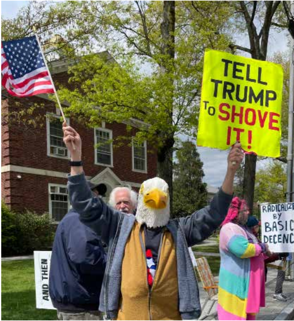
On Almost a weekly basis, progressive groups gather in downtown Mt. Kisco for protests against President Trump and MAGA