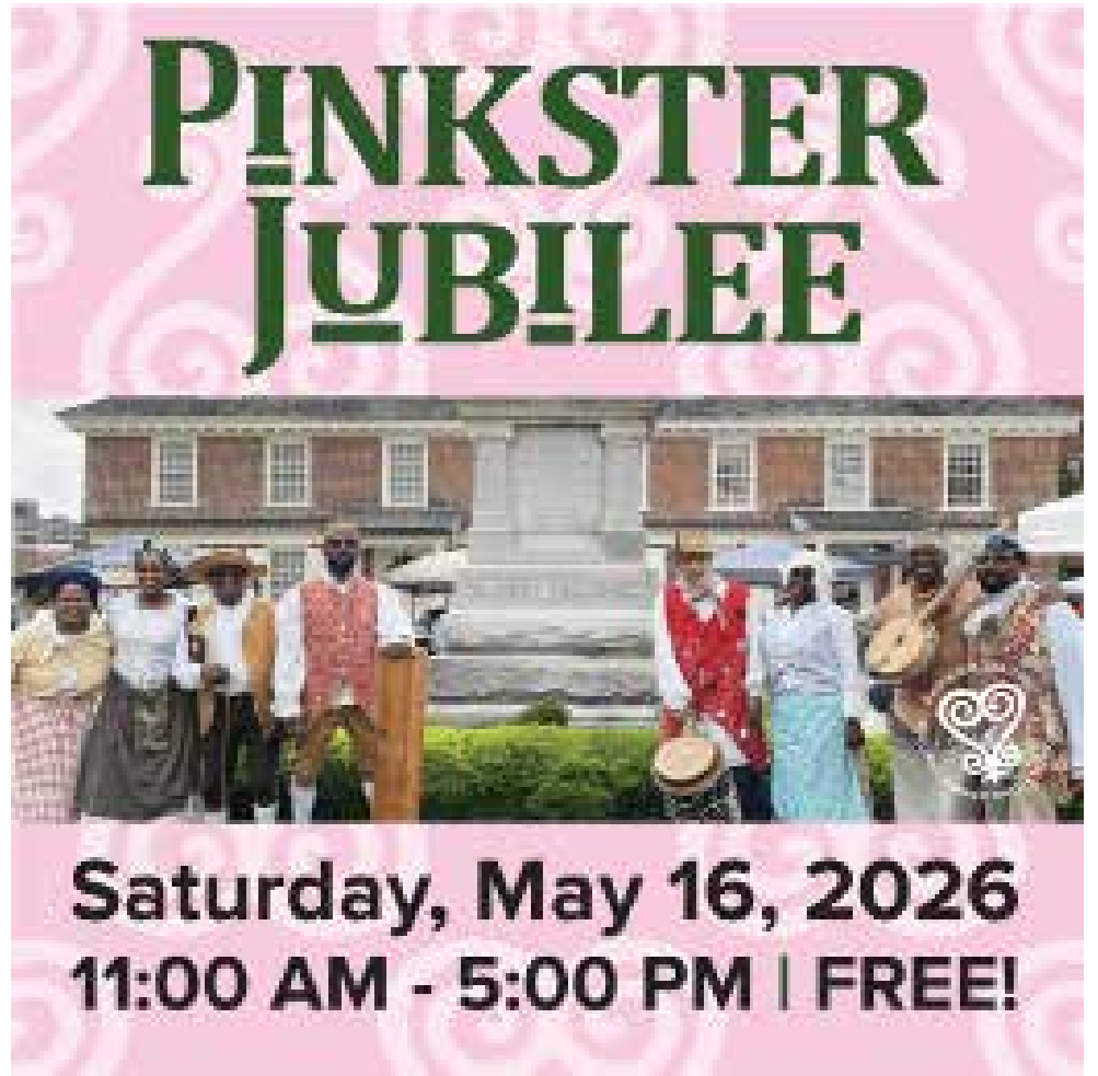
Philipse Manor Hall State Historic Site invites everyone to celebrate the Afro-Dutch holiday of Pinkster, a festival of spring, family, culture, and resistance with live music, dance, games, crafts, food, vendors, history, & more on Saturday, May 16, 2026, from 11:00 a.m. to 5:00 p.m. at Philipse Manor Hall State Historic Site (29 Warburton Ave., Yonkers, NY). Pinkster Jubilee 2026 is part of Yonkers Arts Weekend and is free and open to all

For more information and the full schedule and vendor list, visit https://www.philipsemanorhall.com/programs-and-events/pinkster-jubilee-2026