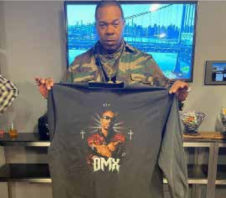
Rapper Busta Rhymes with sold out $200 DMX T-Shirt

The children and family of Yonkers rapper DMX will receive more than $1 Million, thanks to Kanye West, and a $200 t-shirt that quickly sold out. DMX, aka Earl Simmons, died at the age of 50 on April 9.