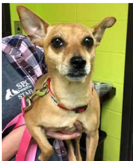
Rescued Dog now named Rue