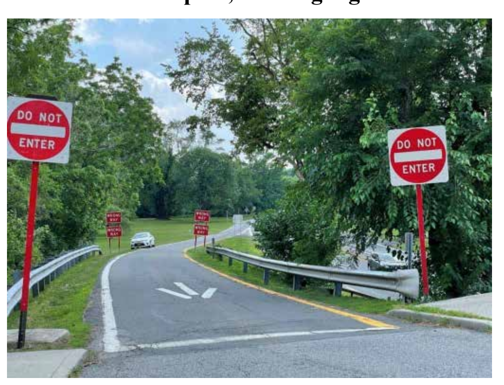
Do Not Enter Signs on the Bronx River Parkway