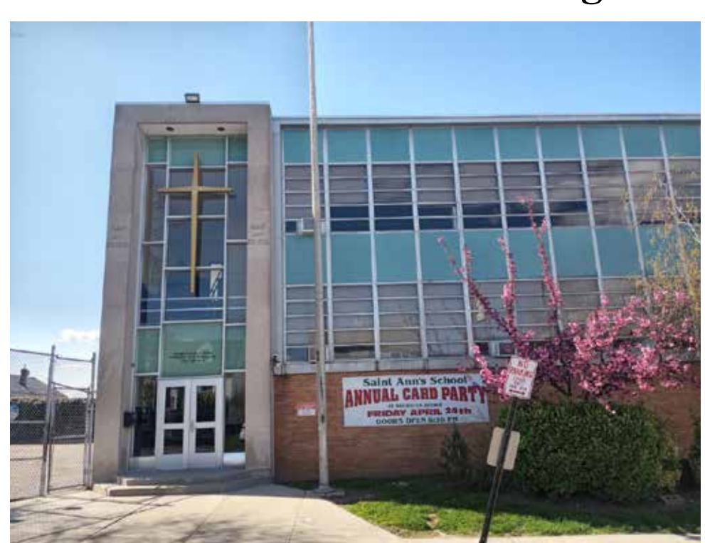
By Dan Murphy

There has been alot of debate and discussion over the recent flights of migrants coming into Westchester County airport. Many of the questions surrounding the flights center on where these mostly teenage migrants go after they get off the flights and into buses.