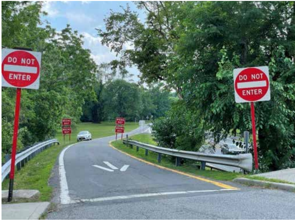
Do Not Enter Signs on the Bronx River Parkway