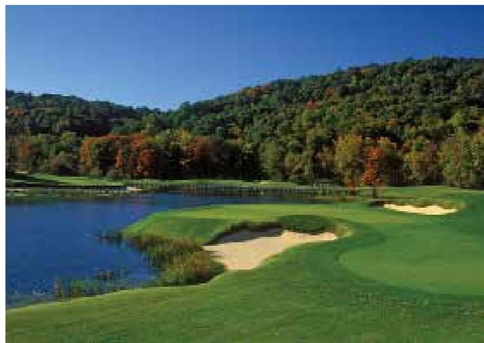
the 12th hole at Hollow Brook Golf Club