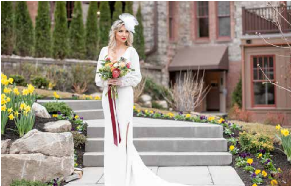
A wedding at the Abbey Inn & Spa, pictured above, are in high demand.