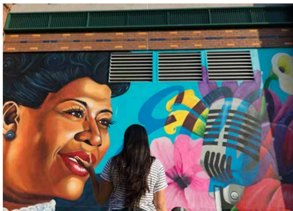
Visitors to Ridge Hill, enjoying the ‘Mural Mile’