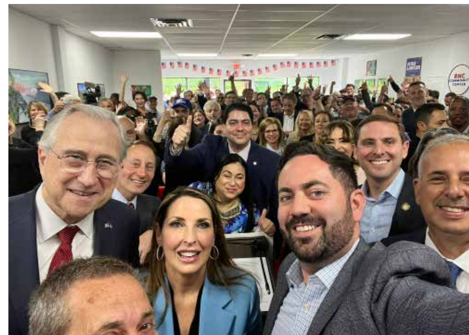
L-R-NYGOP Chair Ed Cox, Republican National Committee Chair Ronna McDaniel, Congressman Mike Lawler, with other republicans