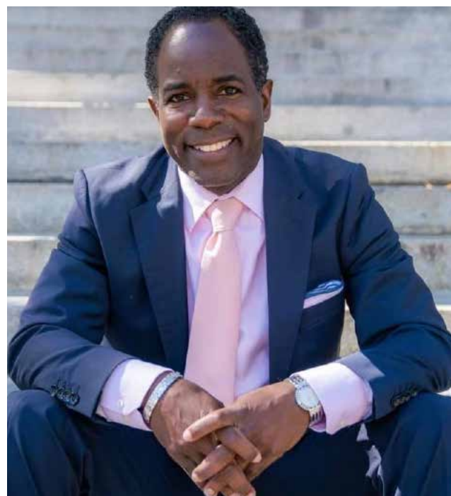
Former Mayor Andre Wallace