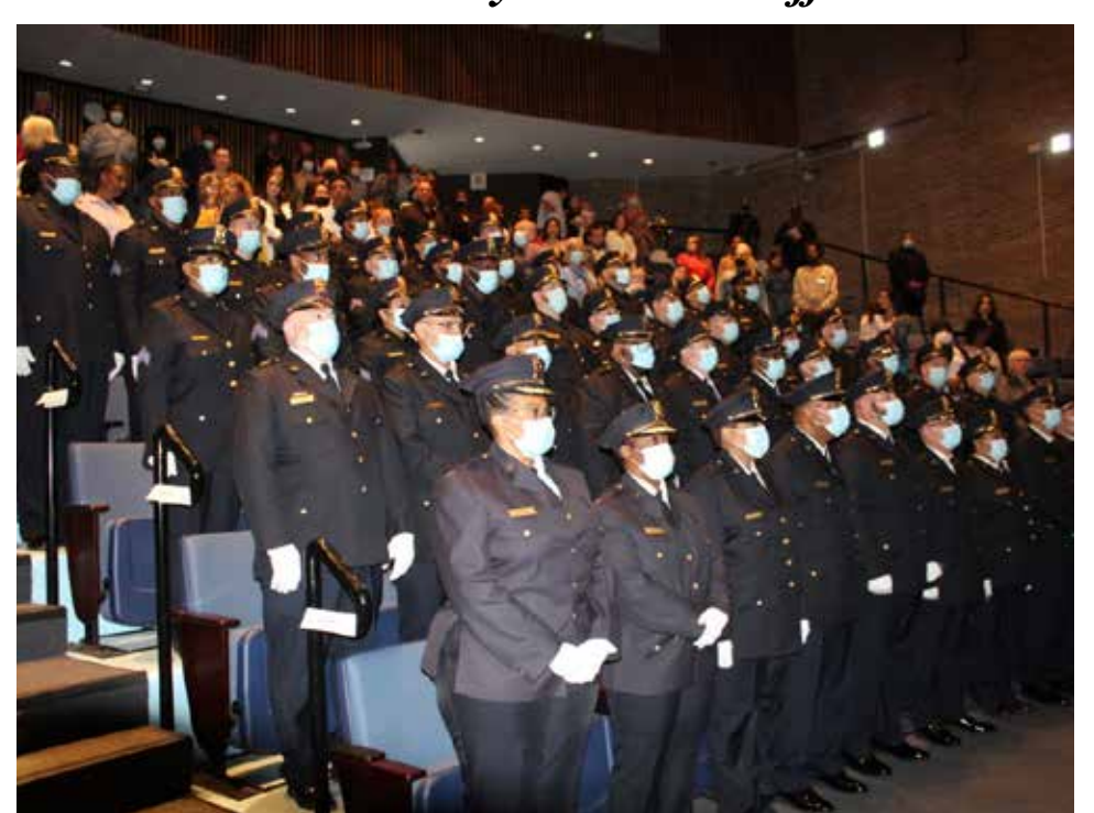
On Friday, May 6, 2022 the Westchester County Department of Correction (WCDOC) held a formal promotional ceremony for two Assistant Wardens, 15 Captains and 32 Sergeants. It was the largest promotional ceremony in the 54 history of the Correction Department.