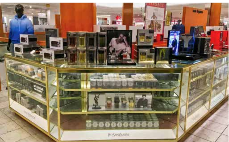
The perfume counters at Macy's, with gift sets that were stolen