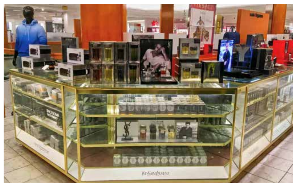
The perfume counters at Macy’s, with gift sets that were stolen