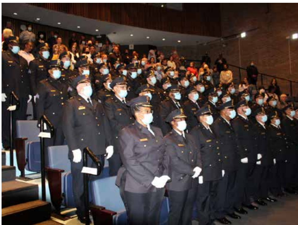
On Friday, May 6, 2022 the Westchester County Department of Correction (WCDOC) held a formal promotional ceremony for two Assistant Wardens, 15 Captains and 32 Sergeants. It was the largest promotional ceremony in the 54 history of the Correction Department.