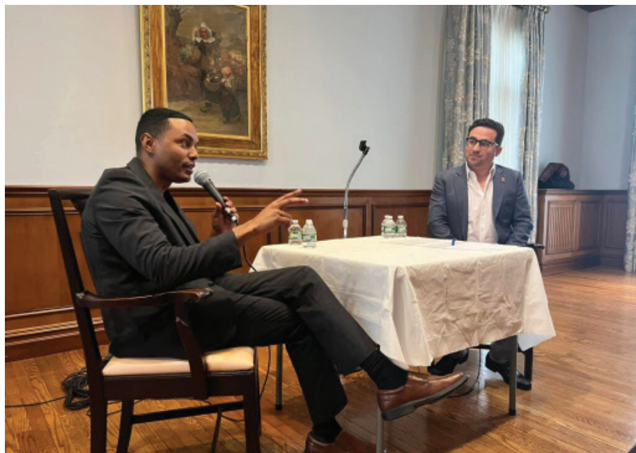
Congressman Richie Torres was the guest speaker of the Westchester Jewish Democrats at the Scarsdale Women's Club