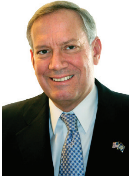
Former NY Governor George Pataki