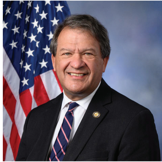
Rep. George Latimer

U.S. Representative George Latimer (NY-16) released the following statement after attending the Presidential Address to Congress tonight: