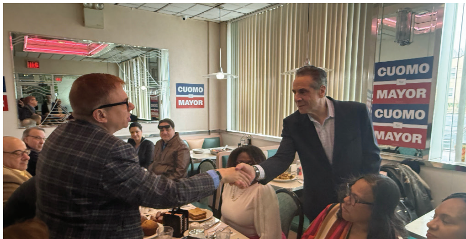
former Governor and former Westchester resident Andrew Cuomo, campaigning for Mayor of New York City