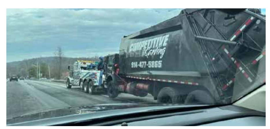
The Town's decision to award their garbage contract to Competitive Carting was what started a six month period of horrible service for 10,000 Yorktown homes,

The state Supreme Court has ruled that Yorktown officials acted legally in 2022 when they voted on an annual garbage contract.