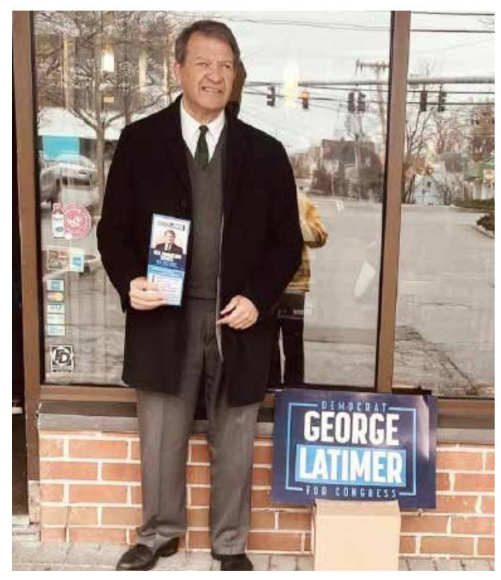
Note to Bowman: Don't Knock Latimer's Campaign Skills, They are Second to None