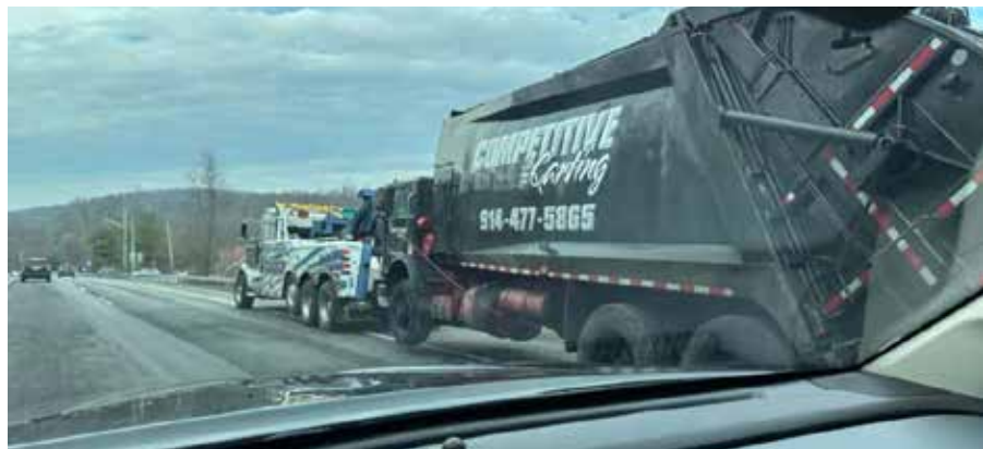
The Town's decision to award their garbage contract to Competitive Carting was what started a six month period of horrible service for 10,000 Yorktown homes,

The state Supreme Court has ruled that Yorktown officials acted legally in 2022 when they voted on an annual garbage contract.