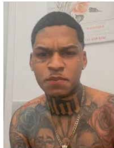
Illegal Marijuana Warehouse Robbery Gone Wrong