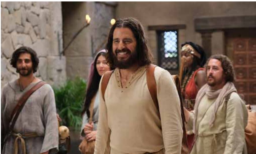
Jonathan Roumie, center, portraying Jesus in The Chosen