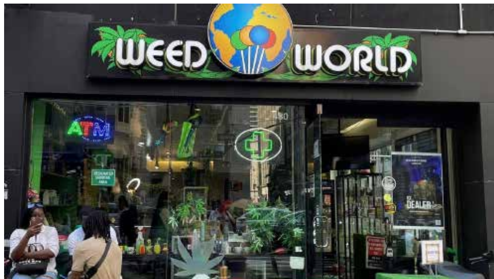
marijuana stores, vans, and people selling on the streets of Times Square, all illegal

“It’s as Easy to Buy an Ounce of Illegal Pot as it is a Slice of Pizza,” in NYC, Michael Bloomberg