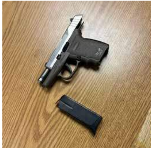
loaded 9MM gun found in vehicle

The Westchester County Police Department posted on social media about a recent traffic stop by an officer on the Saw Mill River Parkway.