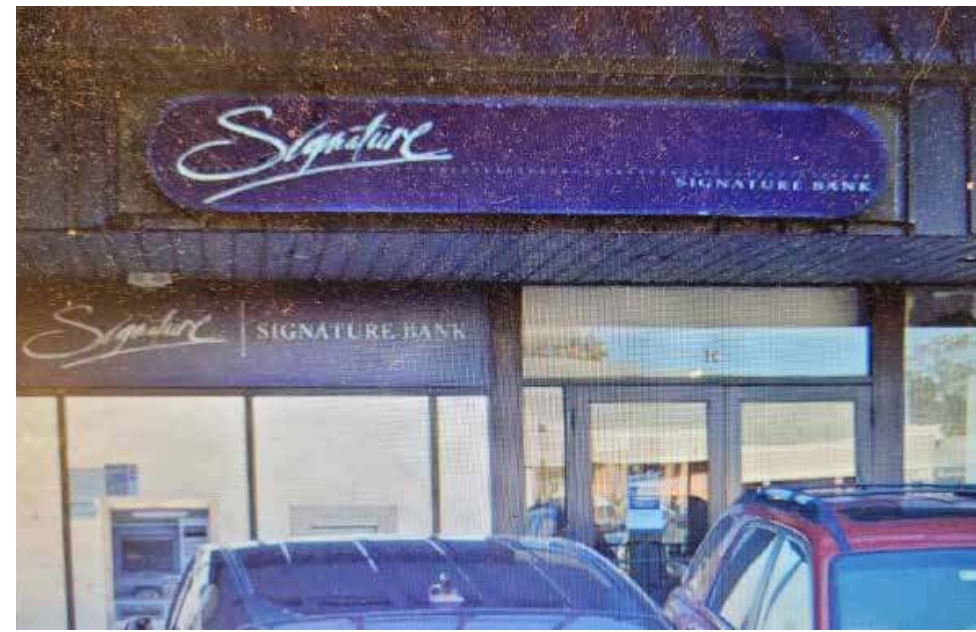
Depositors at Signature Bank brach in New Rochelle were seeking answers