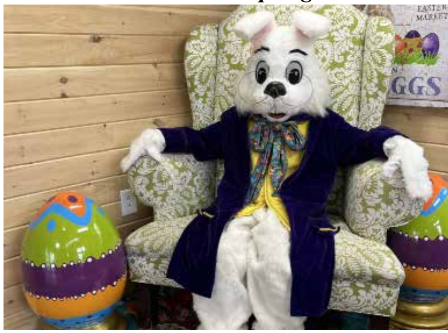
Photo ops with the Easter Bunny at Cross County Center have begun and continues through Saturday, March 30. Special Sensory Bunny and Pet sessions are available this season for the first time! Visitors are encouraged to dress in their Sunday best for photos with the lovable bunny!

Easter Bunny photos will take place in a specially designed pop-up house, located between Gap and Bath & Body Works. Each child who visits the Bunny will receive a free gift.