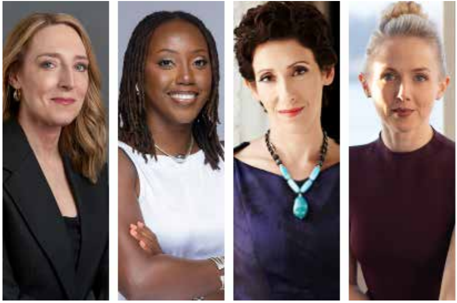
At the Hudson River Museum March 15