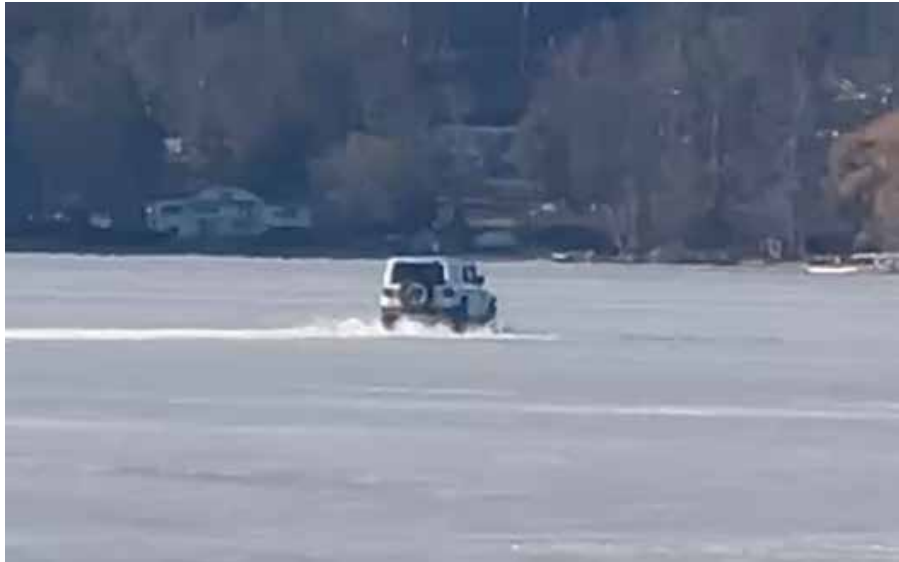
Video captures Jeep driving across Lake Mahopac