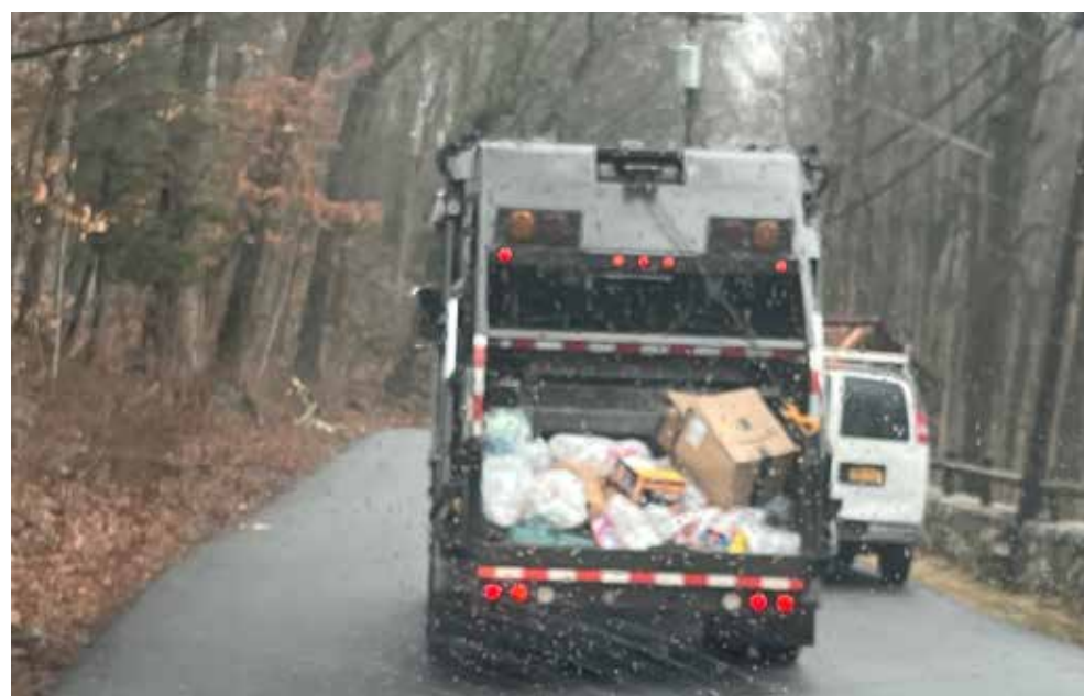
A Competitive Carting truck, comingling trash in Yorktown in January

In This World, You Get What You Pay For!, Kurt Vonnegut