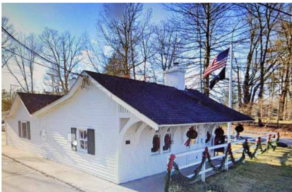
The Waccabus Post Office

Recent Crimes in Eastchester, Harrison, Raise Concerns