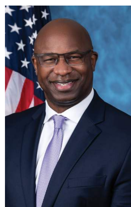
Rep. Mike Lawler, left; Rep. Jamaal Bowman right