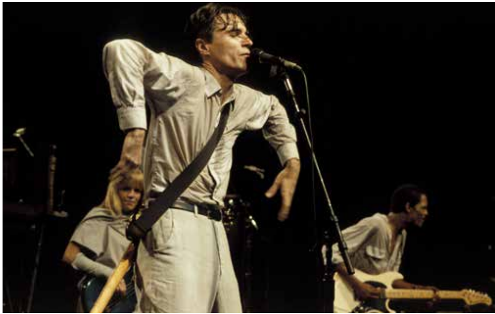
Irvington Theater's Sunset Cinema begins on June 10 with Stop Making Sense

After 15 months of exclusively virtual programming, Irvington Theater is thrilled to welcome back patrons of all ages with in-person, outdoor events this summer — the first summer season in its 119-year history!