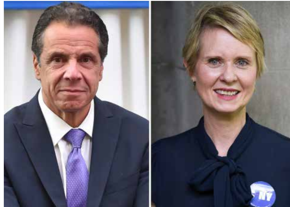
Sex in the City star Cynthia Nixon challenged Andrew Cuomo for Gov. in 2018