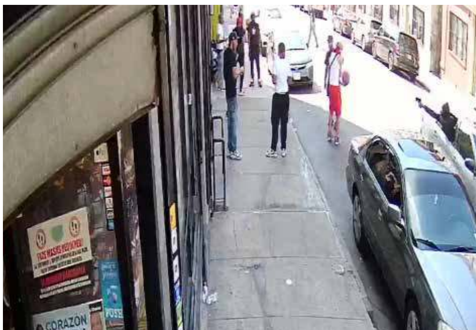
A video camera on Elm Street, Yonkers, caught the shooter moments before shots rang out

Driver Travelling 119 MPH Indicted for Manslaughter: Yonkers Police Quickly Arrest Drive by Shooter