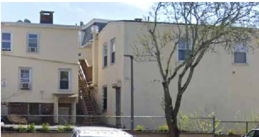
Rear entrance of apartments on South Street Peekskill where attack took place