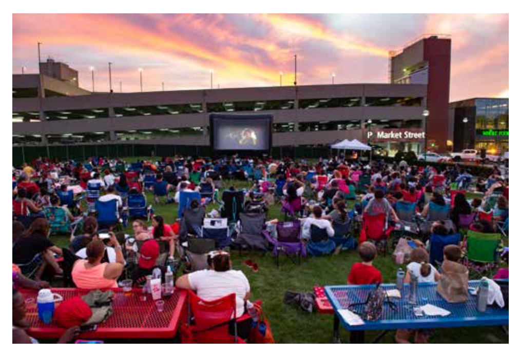
Starting July 5-The Lion King and a Move Every Monday Evening This Summer

Ridge Hill Announces Summer Lineup for "Movies on the Lawn"