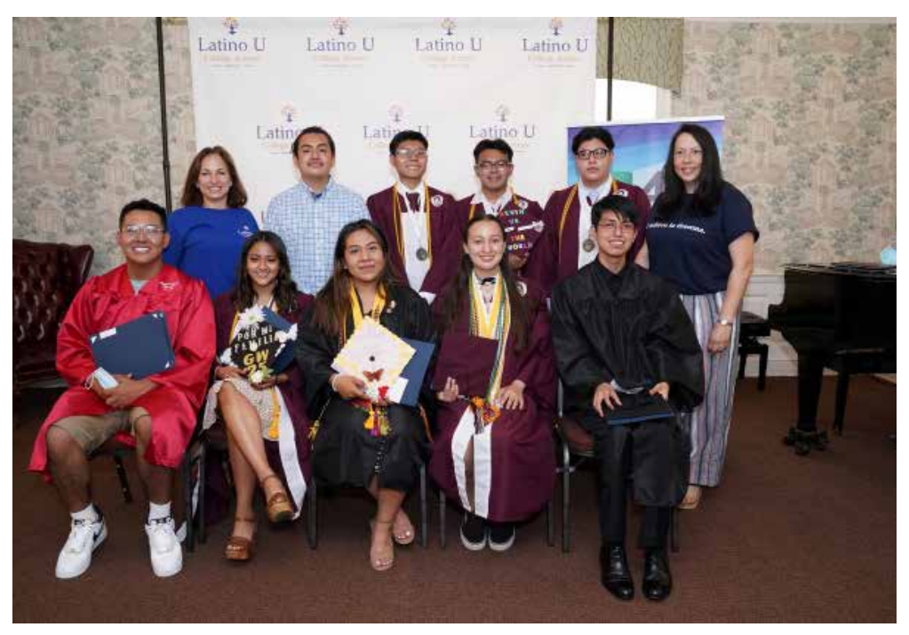
A group shot of this year's LUCA scholarship recipients

:Latino U College Access (LUCA) Awards $10,000 in Scholarships to 1st Generation College Students