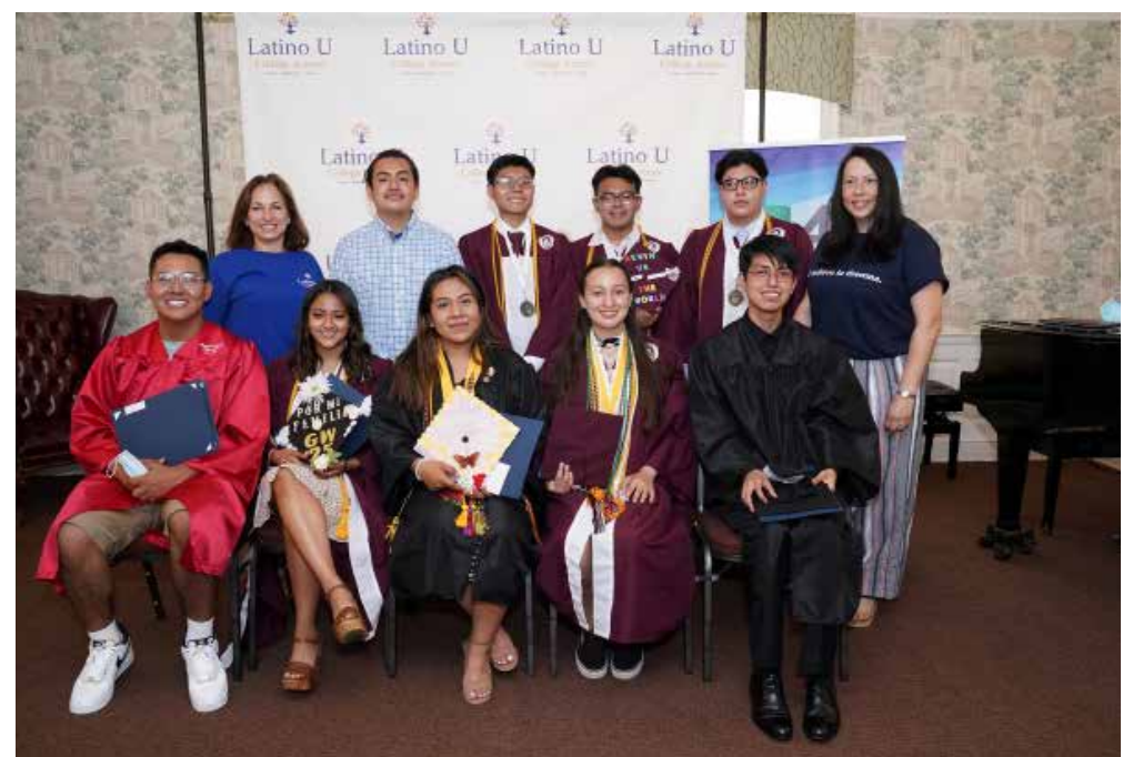
A group shot of this year's LUCA scholarship recipients

On June 19, 2021, Latino U College Access (LUCA) hosted its second annual Familia Appreciation Day honoring the Latino U Scholars graduating Class of 2021 who represent four Westchester County high schools – Alexander Hamilton High School, Ossining High School, Sleepy Hollow High School, and White Plains High School. This celebration was hosted at the Wilson House in White Plains and brought together Scholars, Families, Volunteer College Coaches, and the LUCA team for the first time in-person this academic year.