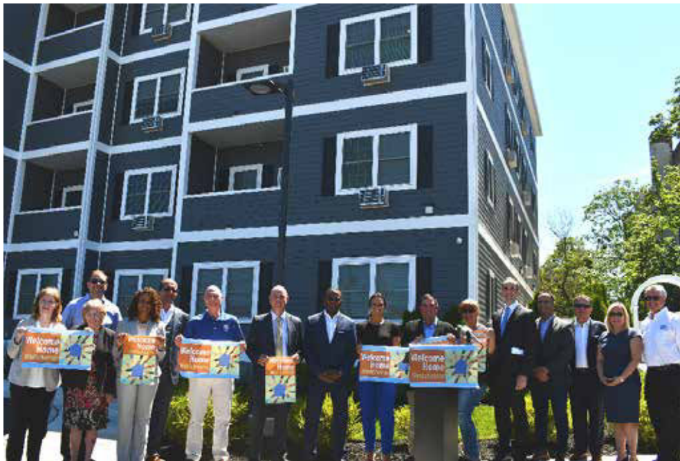
Members of the Welcome Home Westchester coalition pose in front of the Regent Street Senior Apartments, an affordable housing unit in Port Chester

Launches to Combat Affordable Housing Shortage