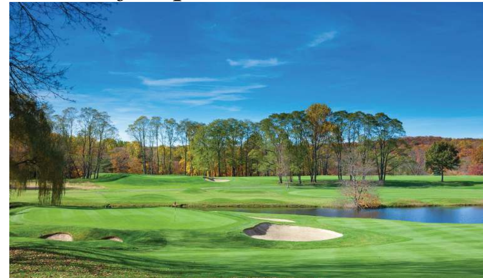
The 17th Hole at The Summit Club at Armonk