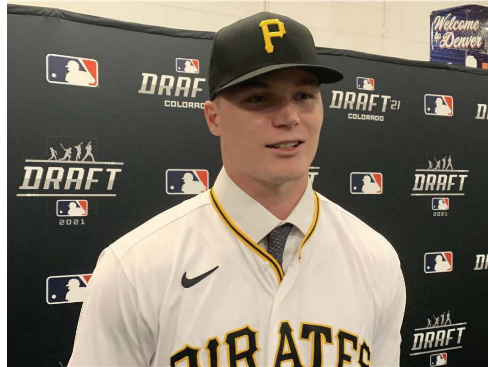
MLB #1 Pick, of the Pittsburgh Pirates, Henry Davis

Henry Davis, who attended Fox Lane High School in Bedford and starred for his high school baseball team, was picked by the Pittsburgh Pirates with the #1 overall pick in the 2021 Major League Baseball draft, held in July.