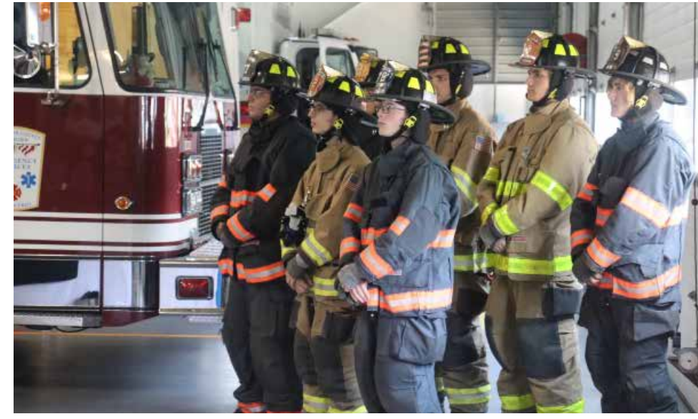
Westchester County will create dedicated safe disposal opportunities for the public and fire personnel, point of sale warnings, and work to educate all on the dangers of these increasingly prevalent batteries.

In response to growing concerns over the potential hazards associated with lithium-ion batteries, Westchester County Executive George Latimer and the County's Department of Emergency Services, Department of Environmental Facilities and Department of Consumer Protection have taken proactive measures to ensure the safety of residents.