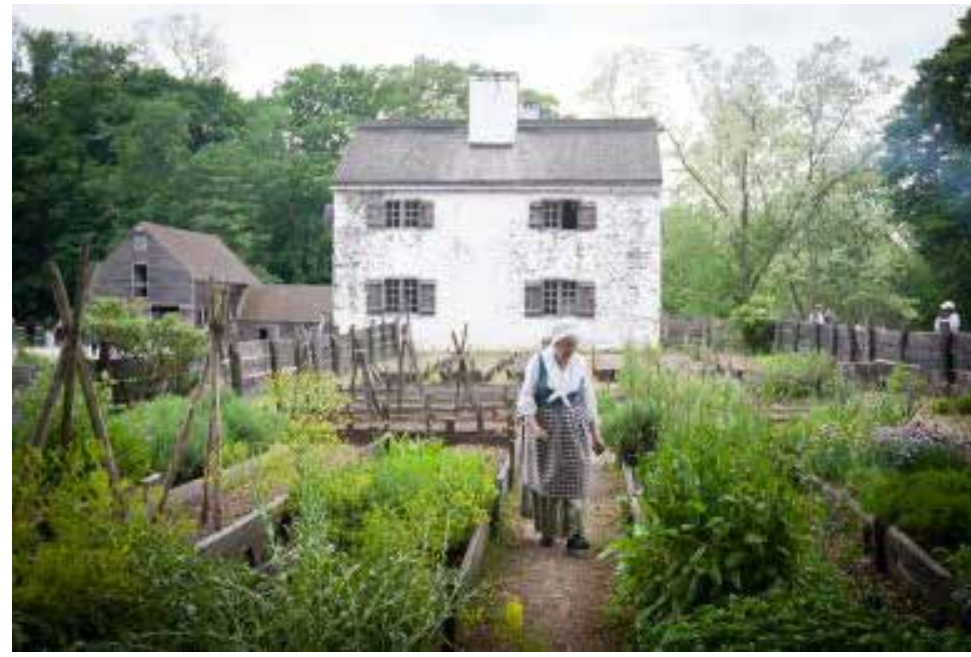
Philipsburg Manor

In response to growing visitor demand, Historic Hudson Valley is pleased to announce the expansion of tours at three of Westchester County's iconic historic sites: Washington Irving's Sunnyside, Philipsburg Manor, and Union Church at Pocantico Hills. Starting July 20, these locations will extend operations to provide additional access to locals and tourists alike, now open weekly from Thursdays through Sundays.